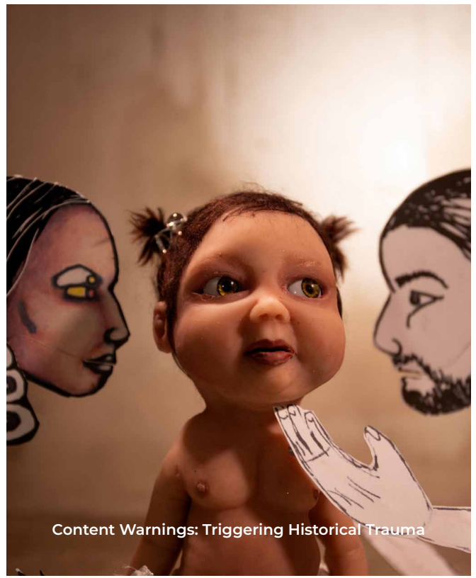
Meneath: The Hidden Island of Ethics